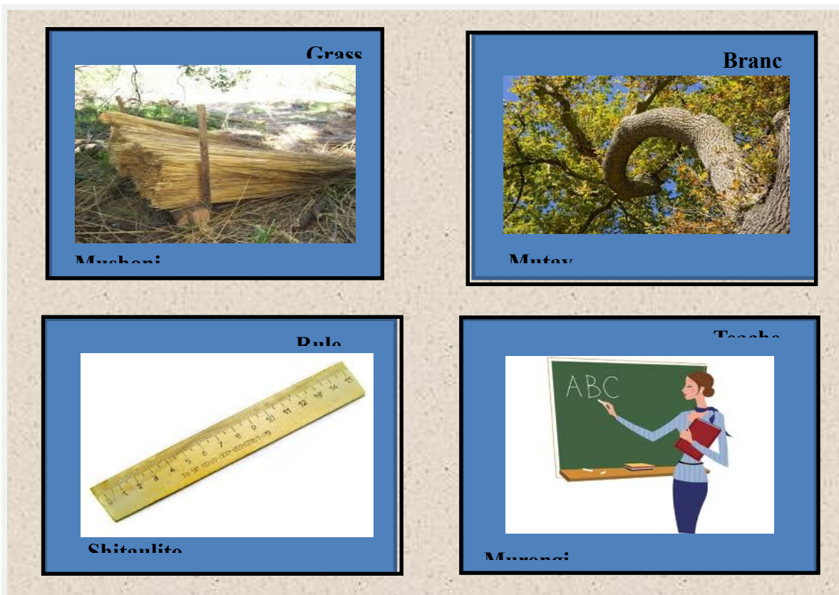
Figure 1: Picture Vocabulary Words

The translation tasks provided basic information on learners' proficiency in English and Rumanyo. This information pointed to possible translanguaging strategies that would build on existing knowledge. Translanguaging in pedagogical practice is not only about code switching in bilingual classrooms, but also about the use of learners' strong language to build or develop the weaker language (Williams, 2003). During the two sessions taught by the first author, the Rumanyo words were used alongside English (see example below). In order for learners to understand the words in English better, pictures were placed next to each word. The same words and pictures were used at the next stage (grass, nature, branch, ruler and teacher), where learners were asked to construct sentences in both languages. Learners constructed their sentences orally – first in groups, then later individually. Pictures were seen as the easiest way to explain the meaning of a word to learners. Besides, pictures were also used to help learners practise speaking in a developing language (English), to say what they can see in a picture, to give specific words for the picture and to create sentences using pictures.