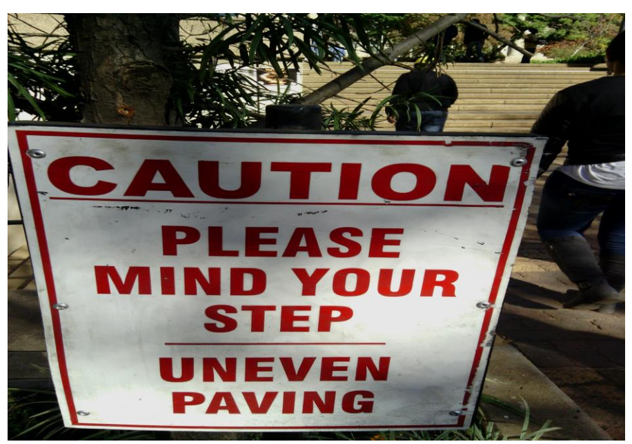
Figure 6: Warning