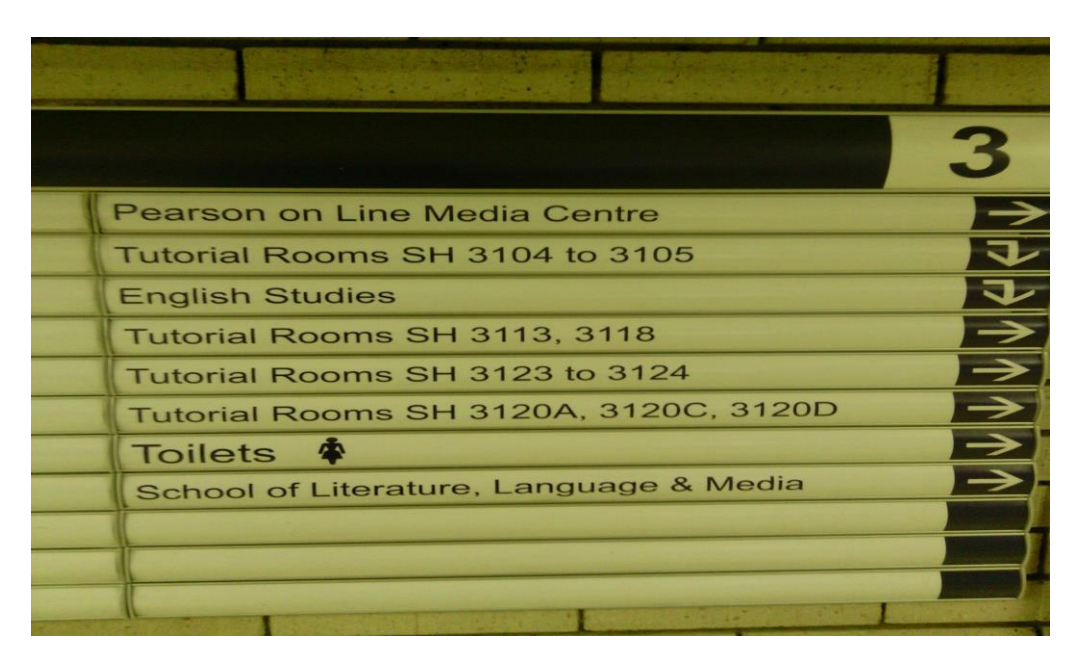
Figure 4: Directions

The only building that has an indigenous name is Umthombo , which houses the School of Humanity and Community Development. Umthombo is a Nguni word which means 'a well or fountain'. Close to this building is a lecture venue with a Nguni name known as Emthonjeni which means 'from the well or fountain'. Beukes (2010: 196) observes that, at most, African languages have been afforded (limited) socio-symbolic significance on some campuses through the use of multilingual signage. At Wits, very little has been done to create a truly multilingual environment, which has resulted in the visibility of indigenous languages being low. Directions to buildings and venues are all given in the English language as shown in Figure 4 below.