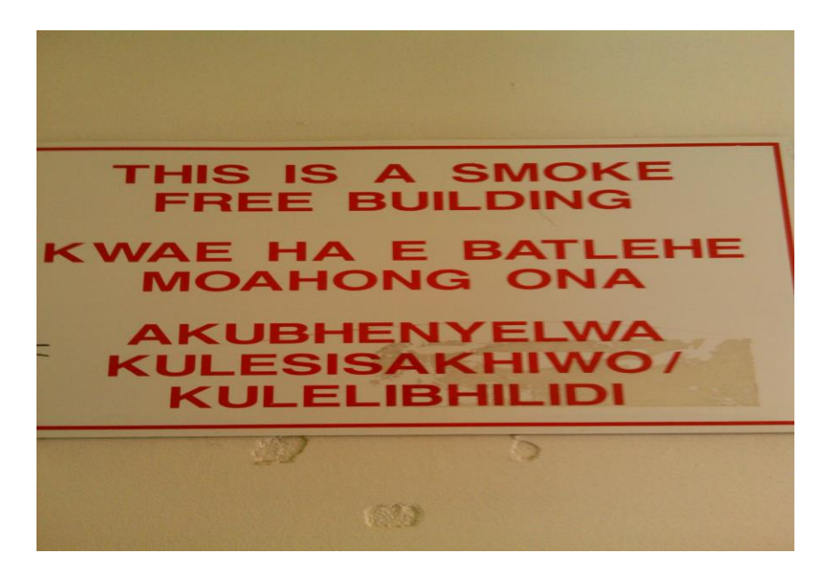
Figure 8: A multilingual warning on smoking

As mentioned earlier, at Wits, there is only one notice that appears in three languages. This multilingual notice is about the prohibition of smoking inside buildings.