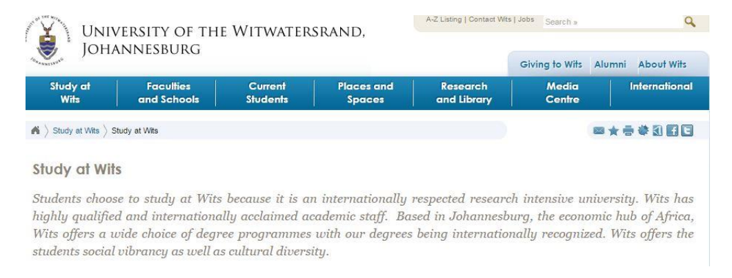
Figure 1: The Wits website

Like any other institution, Wits communicates with its stakeholders (staff and students) and the world at large through its website. Unlike other institutions that have multilingual websites, the Wits website is monolingual; it is in English only, as shown in Figure 1 below: