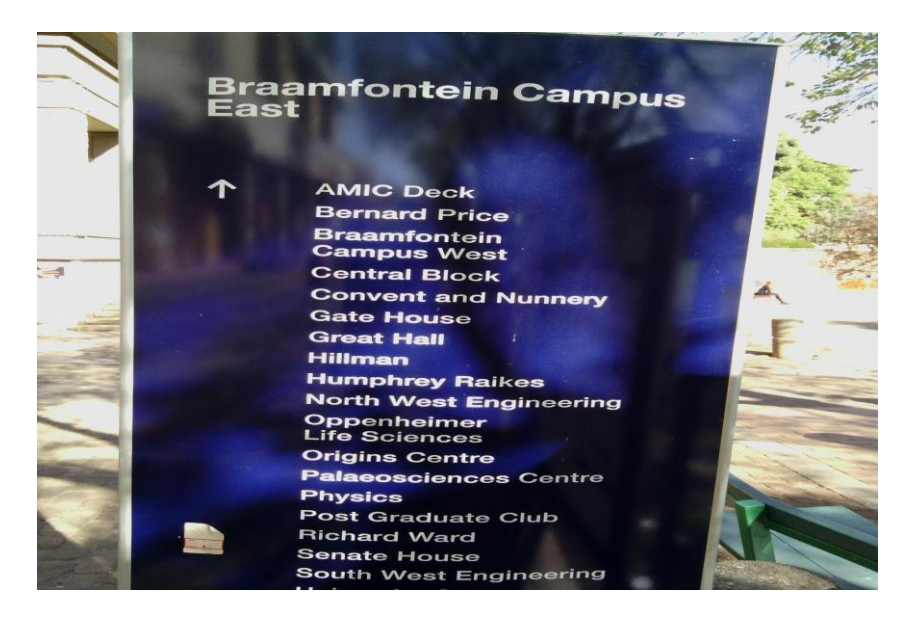
Figure 3: Names of buildings

While the Wits language policy advocates multilingualism, the public signage at this institution is largely monolingual. It is mainly in English. Although the policy underscores the importance of African languages, especially Sesotho, the LL of Wits shows limited use of this language or any other indigenous South African languages. Negro (2009: 208) correctly charges that 'probably nothing is more symbolic for a community than its own name[s]'. At Wits, names of building, lecture venues, directions and notices are in English, except for one notice which prohibits smoking inside buildings and has Tswana/Sesotho and isiZulu translations. Names express the cultural values and sensibilities espoused by a community. Figure 3 below shows some of the names of major buildings at the Wits campus. What do these names symbolise in relation to Wits identity?