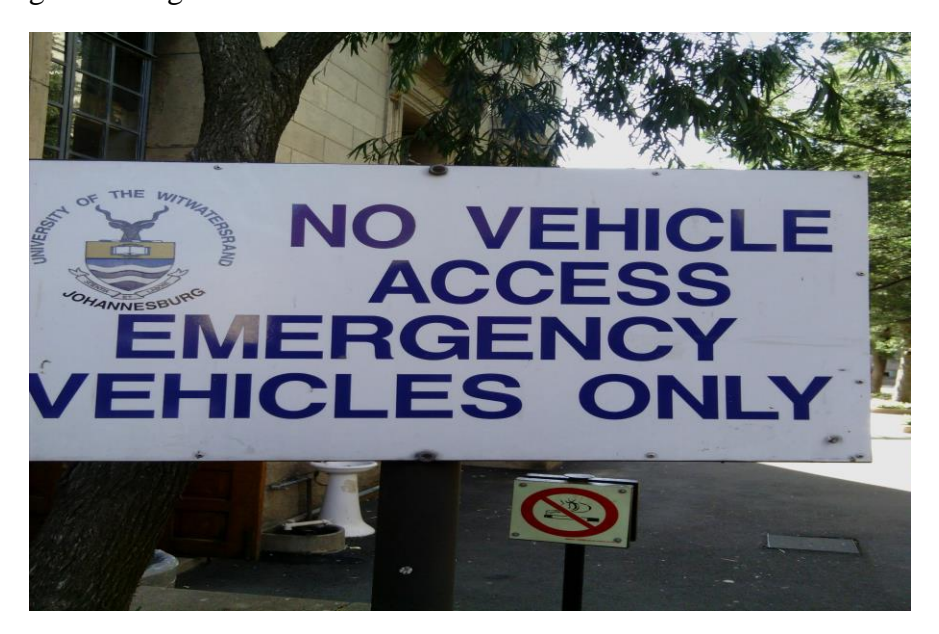
Figure 5: Warning

Warnings are meant to convey important information to the public. The best way to communicate would be in the languages that the public understands. At Wits, most warnings, except one, are in English. Examples of important warnings that appear in English only are given in Figures 5 and 6 below: