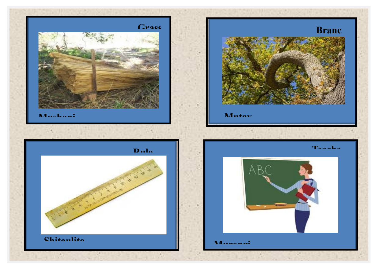
Figure 1: Picture Vocabulary Words

The translation tasks provided basic information on learners' proficiency in English and Rumanyo. This information pointed to possible translanguaging strategies that would build on existing knowledge. Translanguaging in pedagogical practice is not only about code switching in bilingual classrooms, but also about the use of learners' strong language to build or develop the weaker language (Williams, 2003). During the two sessions taught by the first author, the Rumanyo words were used alongside English (see example below). In order for learners to understand the words in English better, pictures were placed next to each word. The same words and pictures were used at the next stage (grass, nature, branch, ruler and teacher), where learners were asked to construct sentences in both languages. Learners constructed their sentences orally – first in groups, then later individually. Pictures were also used to help learners practise speaking in a developing language (English), to say what they can see in a picture, to give specific words for the picture and to create sentences using pictures.